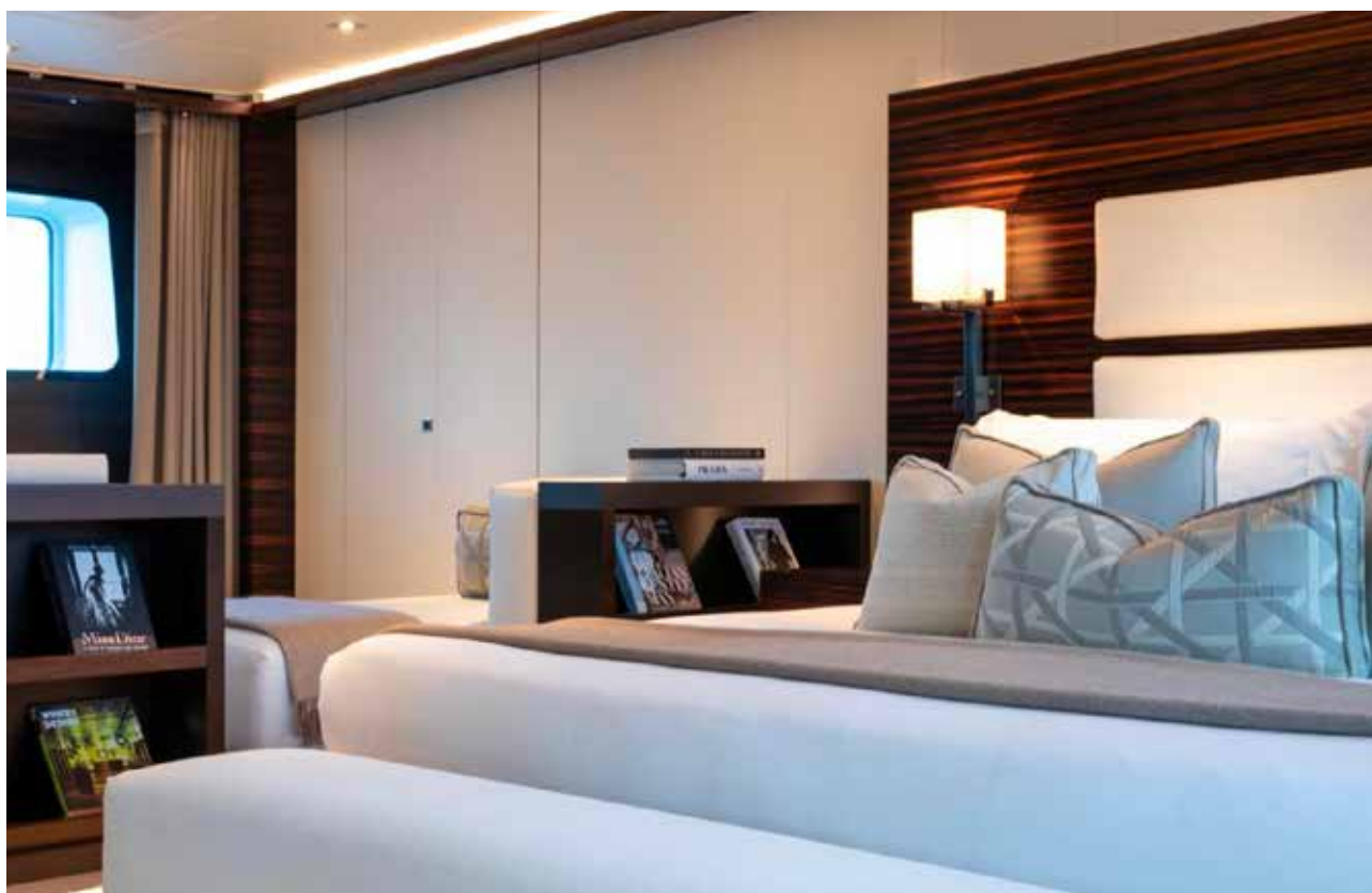
VIP CABIN MAIN DECK