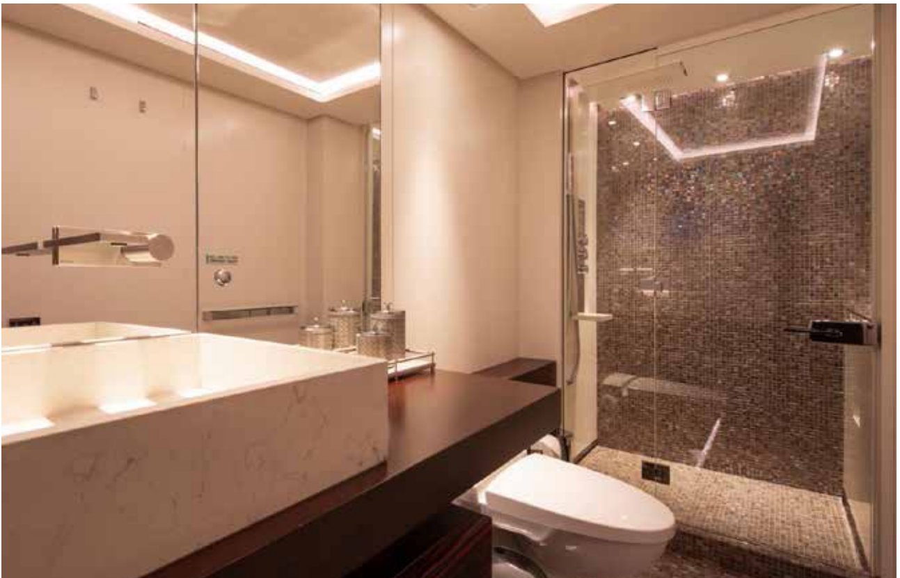
GUEST CABIN 4. BATHROOM