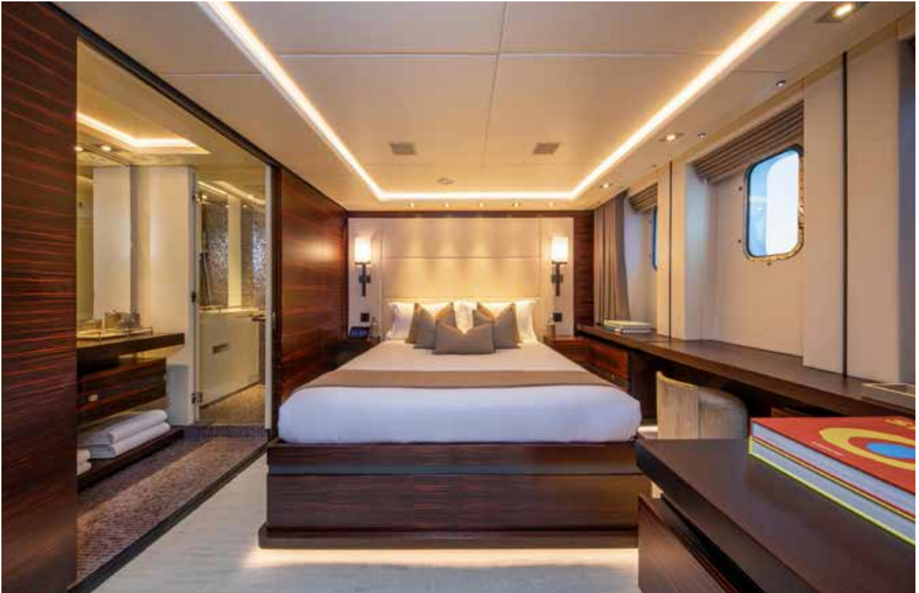
GUEST CABIN 3