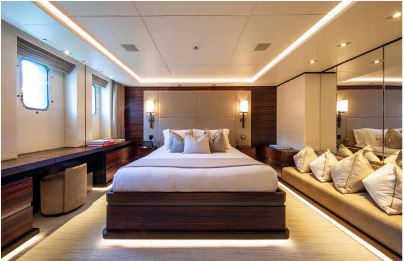
GUEST CABIN 1