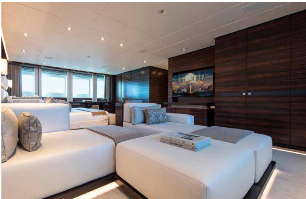
VIP CABIN MAIN DECK