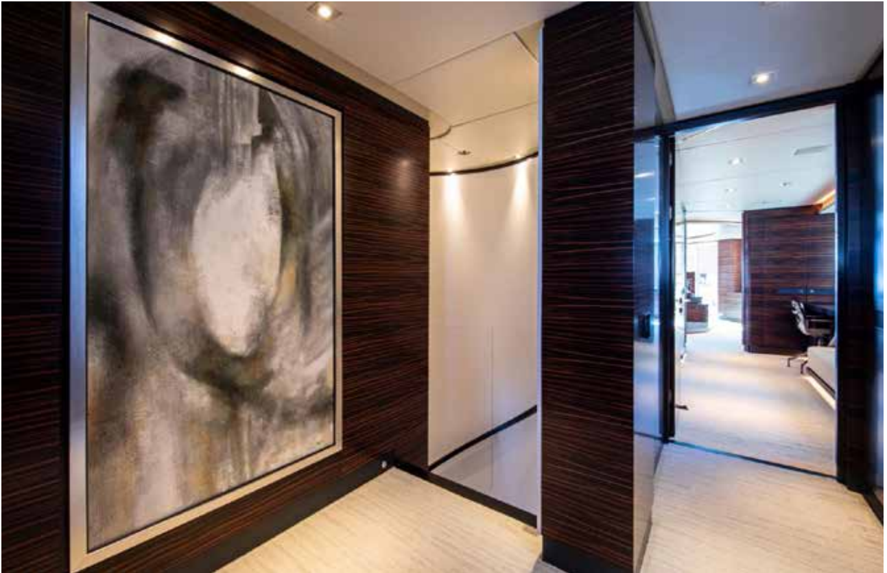
HALLWAY OWNERS DECK