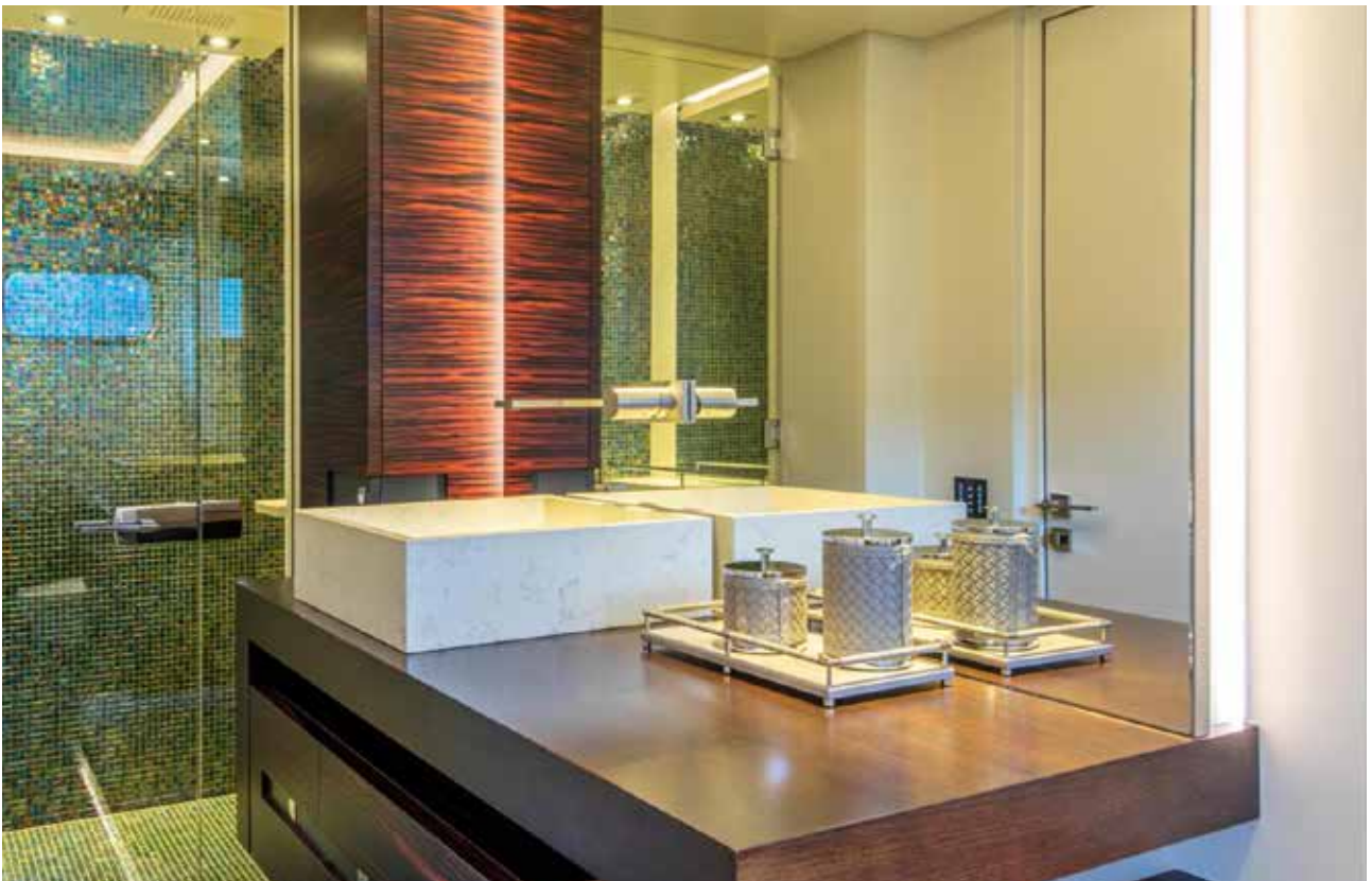
GUEST CABIN 2. BATHROOM