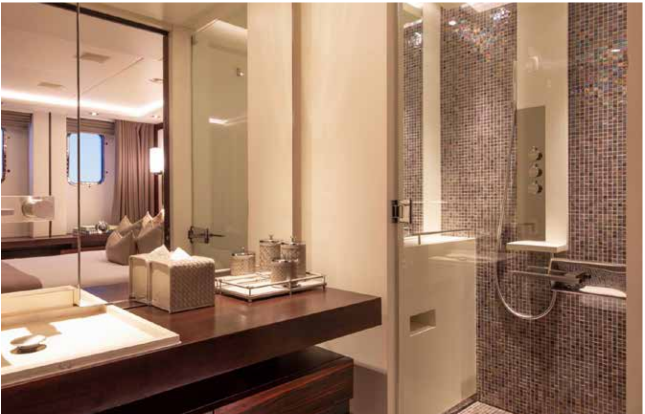
GUEST CABIN 3, BATHROOM