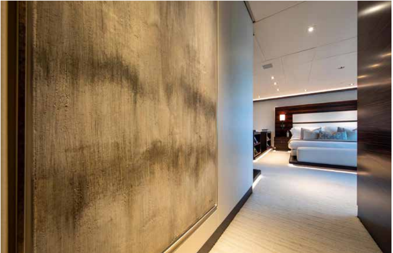
ENTRANCE VIP CABIN