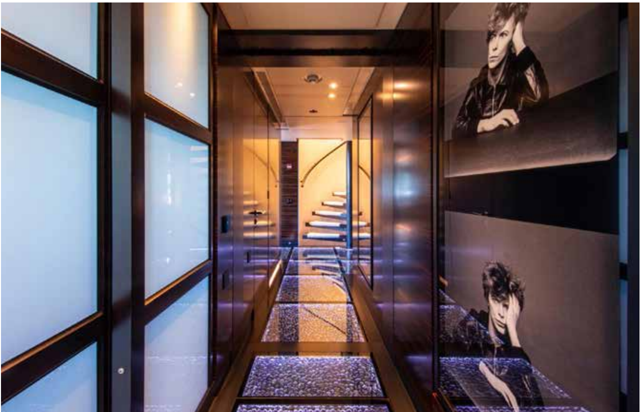
HALLWAY MAIN DECK