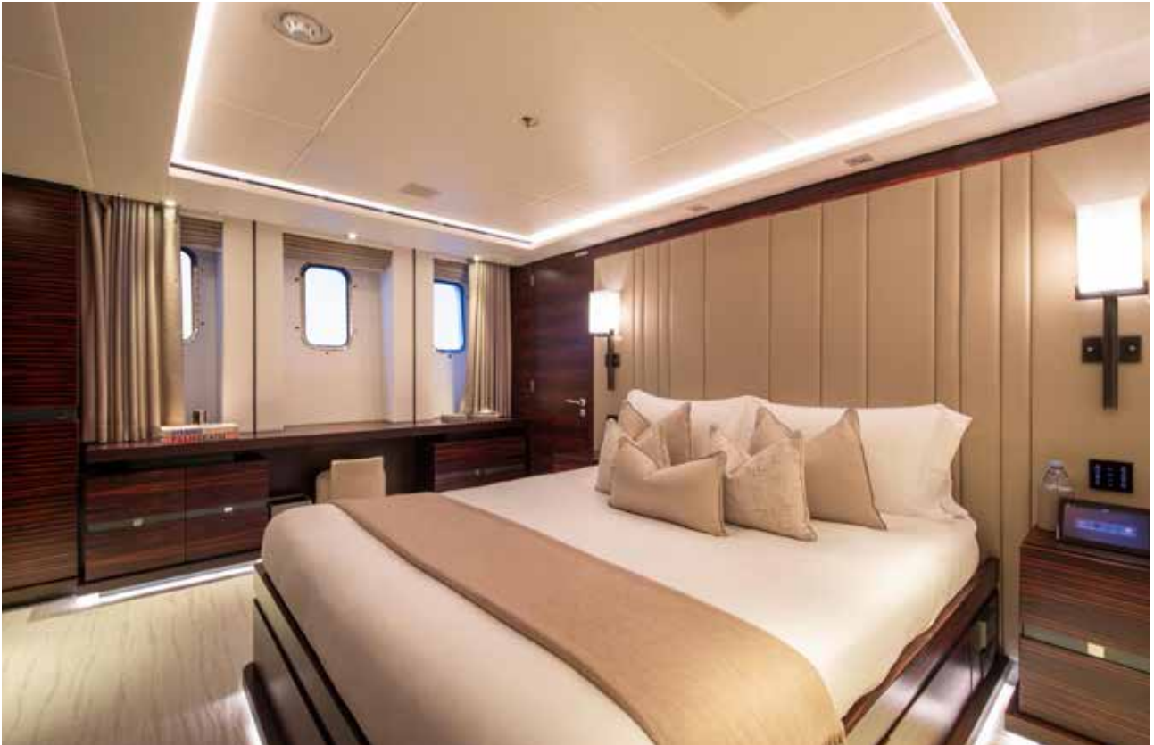
GUEST CABIN 4