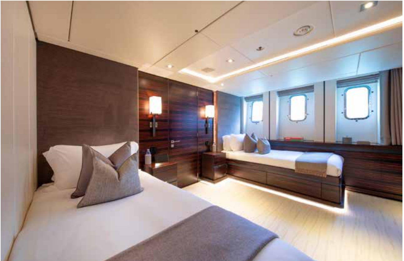
GUEST CABIN 2