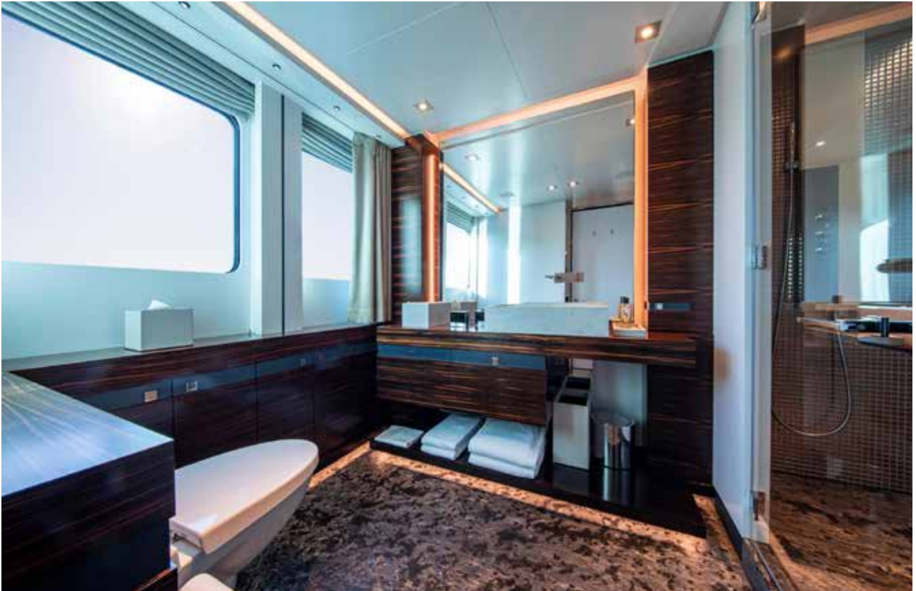
VIP CABIN BATHROOM