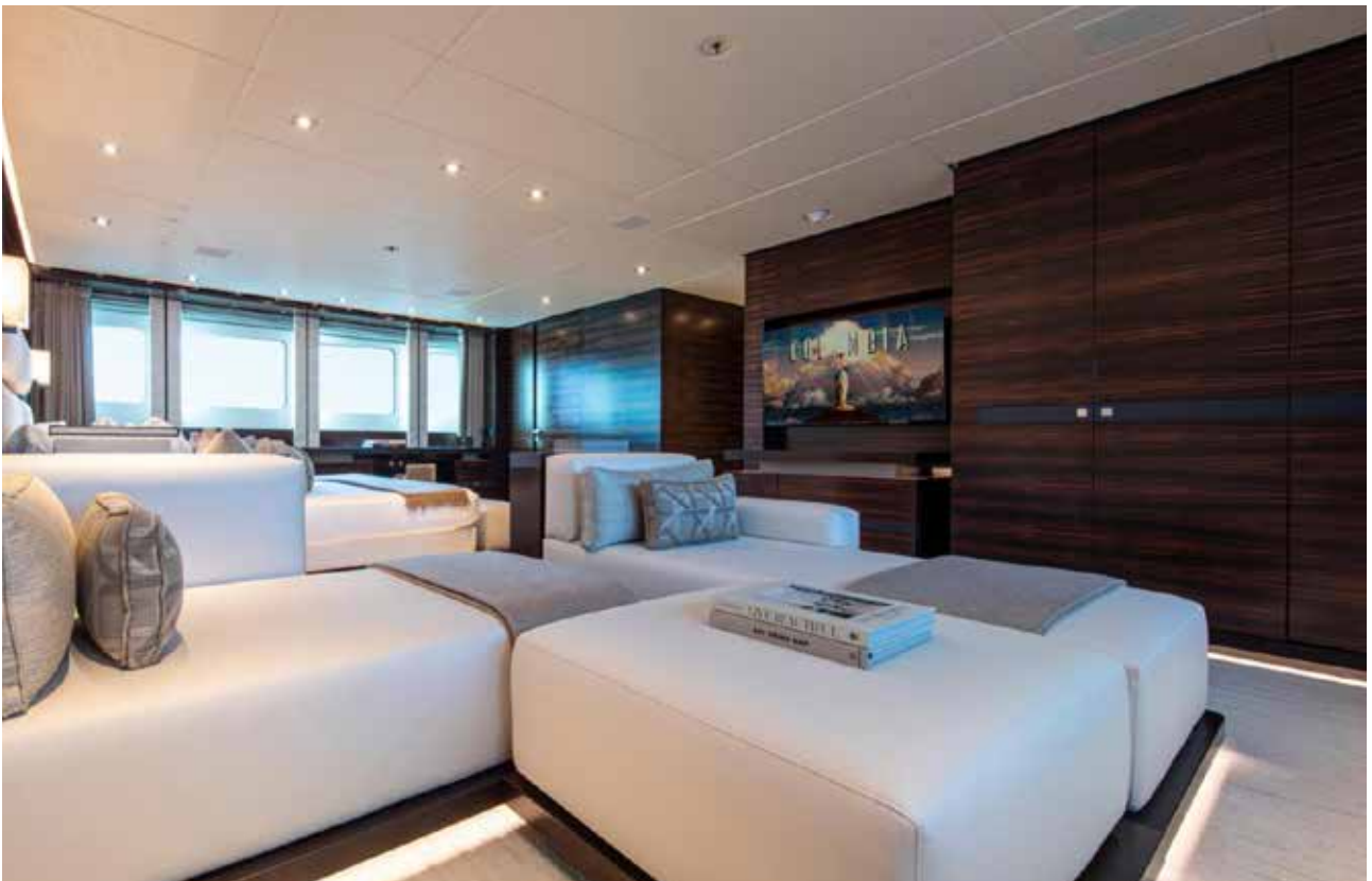
VIP CABIN MAIN DECK