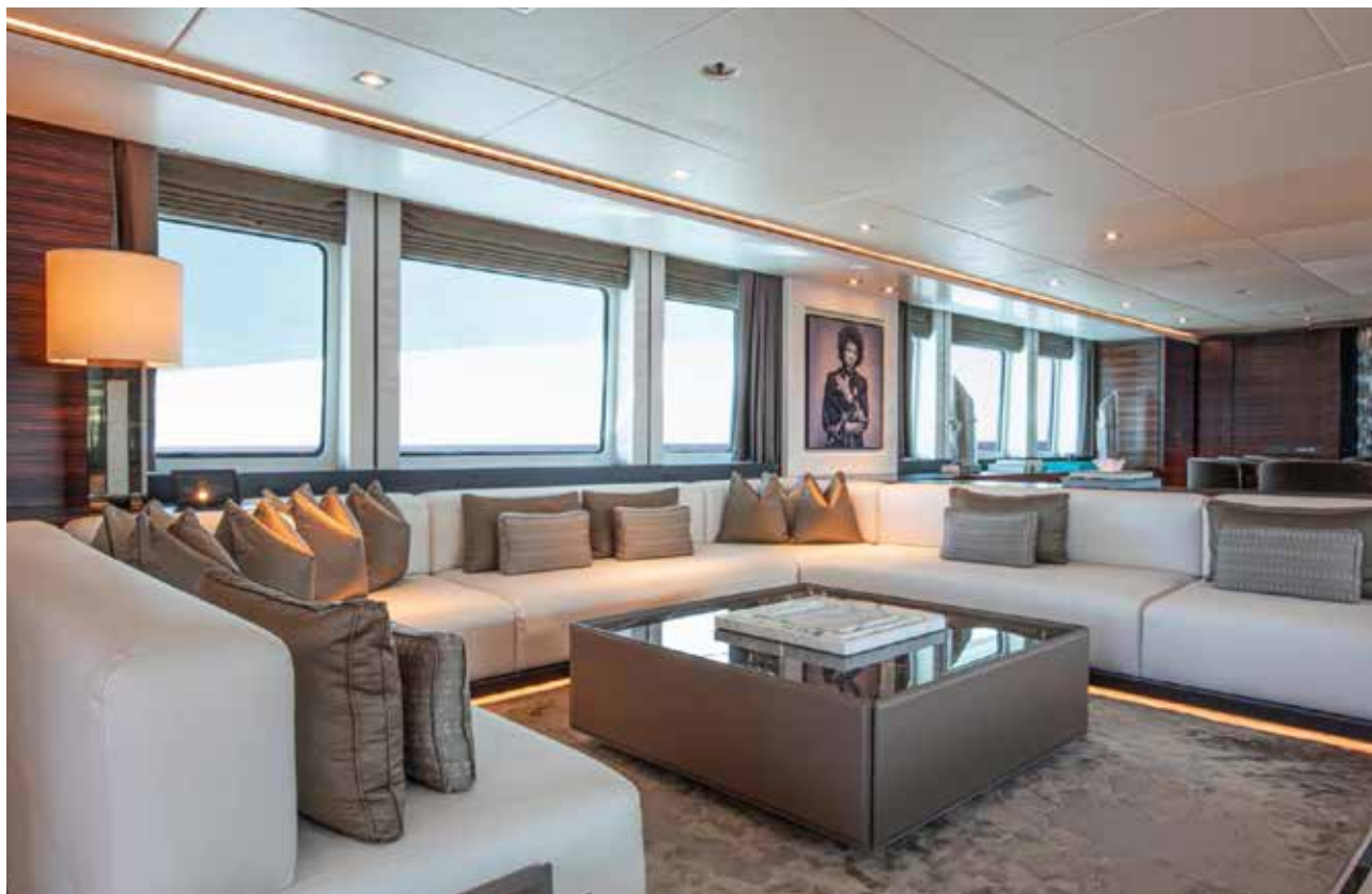
LIVING MAIN DECK