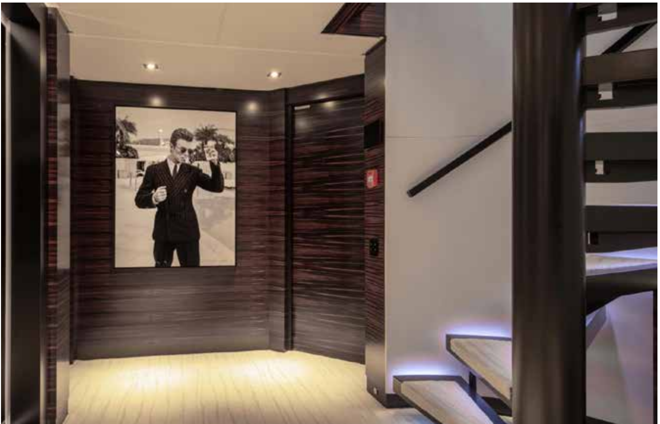
HALLWAY GUEST CABIN