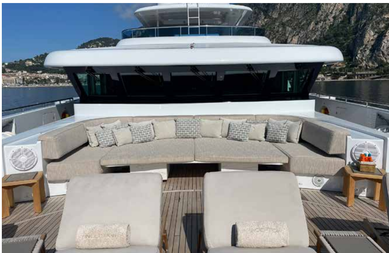
SEATING AREA FOREDECK WITH CINEMA OPTION