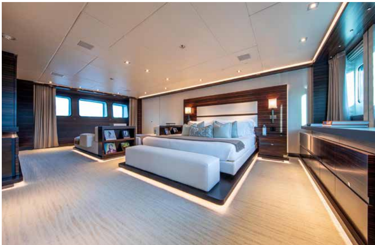
VIP CABIN MAIN DECK