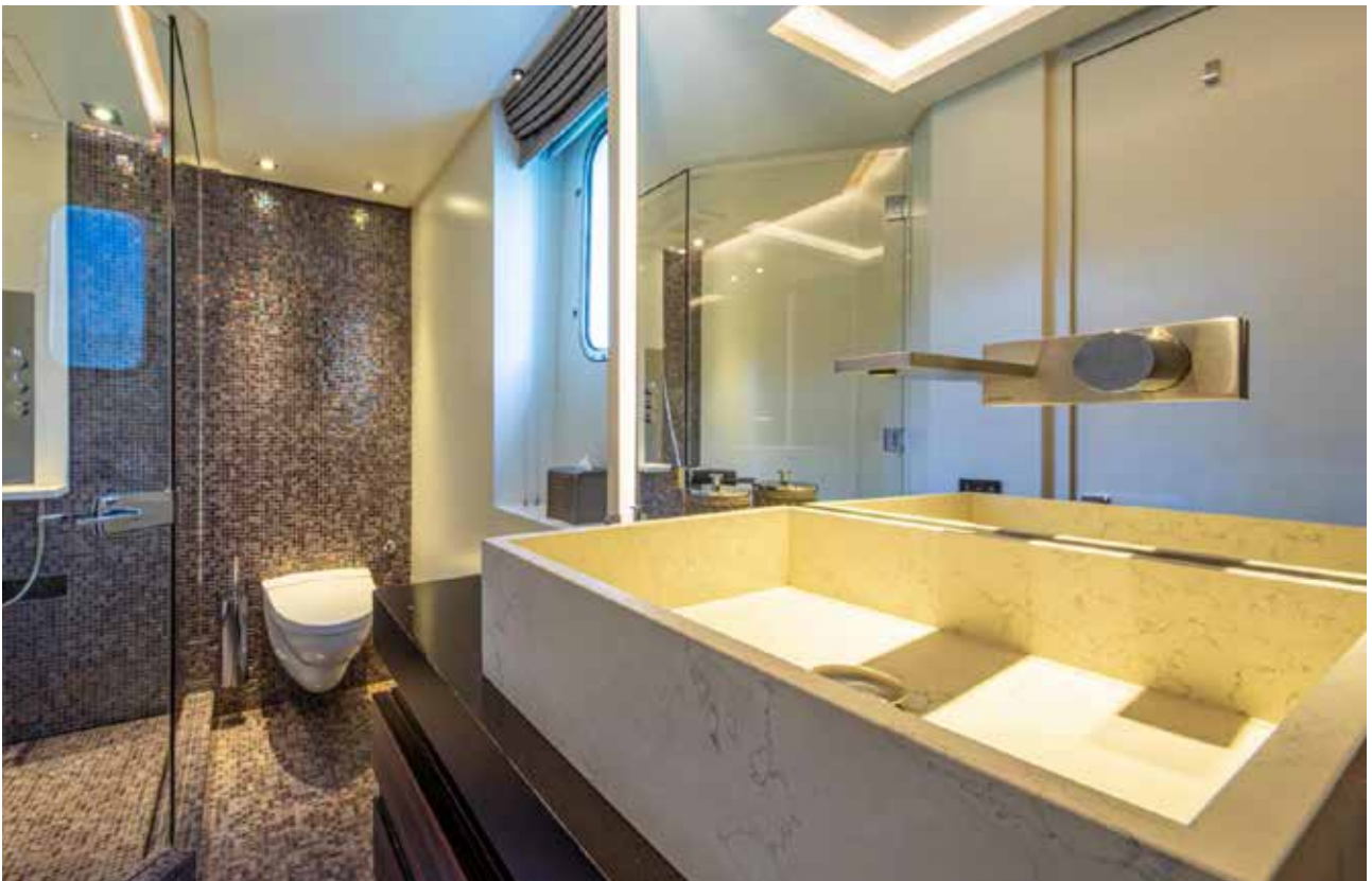
GUEST CABIN 1. BATHROOM